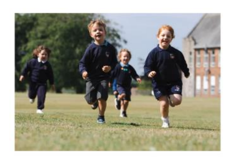
Open Days & Visits Open days at West Buckland School. westbuckland.com

Please see here information regarding the West Buckland Open Day. This looks like a fantastic opportunity to explore the school and seek further information.